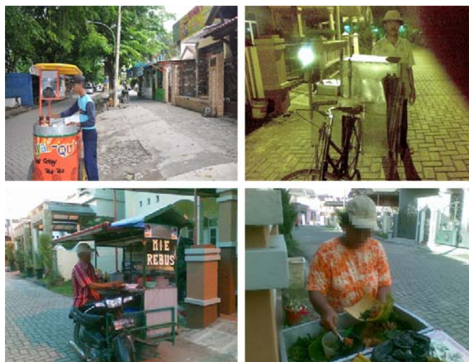
Fig. 1. Mobile food vendors in Indonesia peddling their trade.

Indonesia had 47,702,310 microenterprises that provided jobs for 77,061,669 people, representing 81.7% of all employed workers at the time [8]. Despite this scale, microenterprise based livelihoods show distinct forms of vulnerability: inadequate or deeply uneven income streams, low productivity, and difficult working conditions [23]. For marginal, transitional, or displaced populations, microenterprise may provide important but problematic livelihoods of last resort. Thus, design and policy interventions targeting microenterprise represent one good approach to tackling issues of poverty and marginality in developing countries.